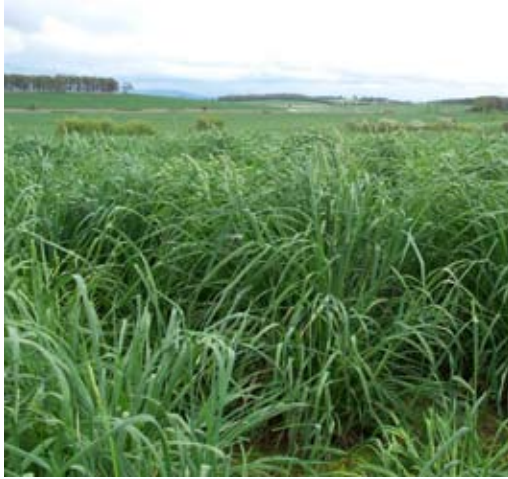
Crown Royale Orchardgrass production in Oregon